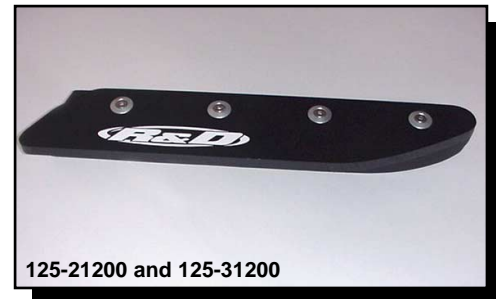
125-21200 and 125-31200